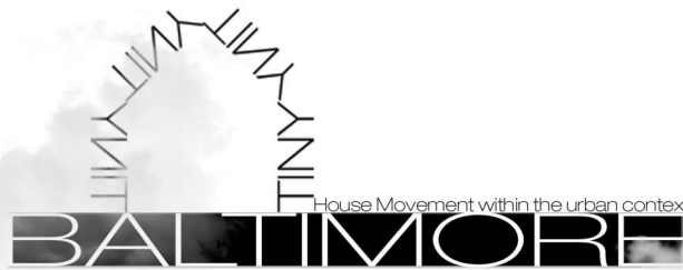
House Movement within the urban context exploring what it means to live minimally today.

Technical Samples available upon request