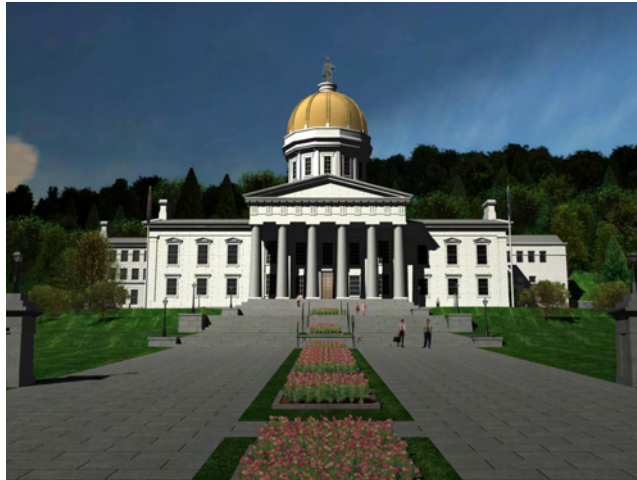
3-D images of the State House were generated by Lincoln Brown, upLink 3D