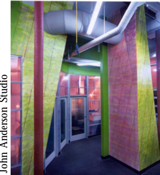
John Anderson Studio